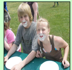
Messy fun had at the "find the bubble gum in the whip cream" contest