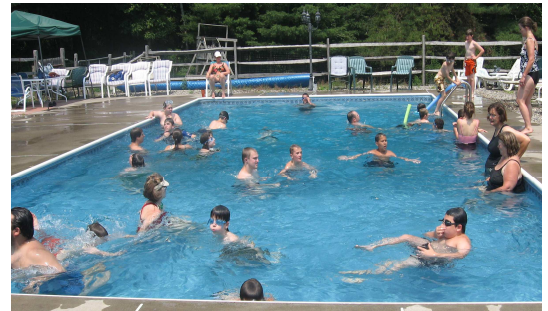
Summertime Fun at Goatland!

It's hard to believe that the Summer Program has already come and gone. We had a full house... 20 kids on the Spectrum per day, Monday-Friday from 9am to 4pm. The Summer Program is really a clinical Social Skills Immersion Program. The kids are with each other for longer periods of time enabling them to bond with the staff and their peers. The kids were so kind and caring to each other and we saw tremendous growth in their abilities to be compassionate and solve problems, while still having tons of fun!