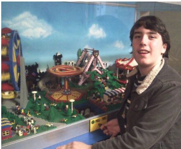
Above: Having fun during a field trip to the Children's Museum of West Hartford!