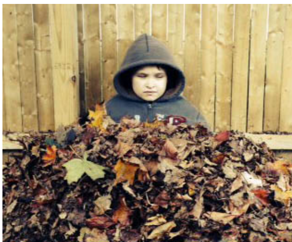
Above: Fall fun at FOCUS !