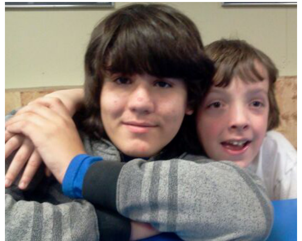
Friendships abound in our FOCUS programs, thanks to you!