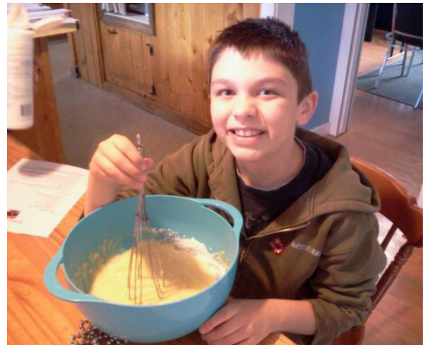
Above: Making tasty treats during the Clinical Educational Support Program

FOCUS offers programs that help children learn to grow both socially and emotionally. Your donation today will make a difference for our children and our families!