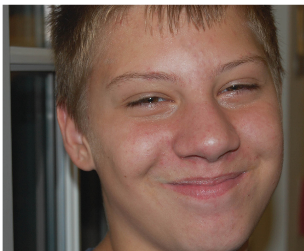
Our teens can be themselves at FOCUS events! Volunteer today!