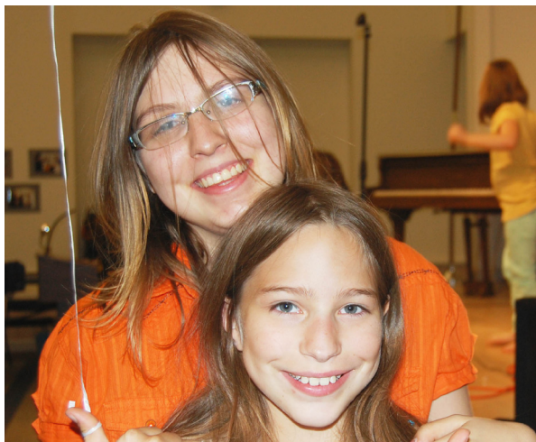
Above: Friends enjoying the Fall Party