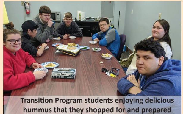
Transition Program students enjoying delicious hummus that they shopped for and prepared

This fall, we expanded our Fresh Start School into the “Annex” building we are renting right down the street on RT 44. This expansion gives our older students their own special place and allows the younger students to have more room at our Dowd location or “Mother FOCUS” as it has become known. Many of the older adolescents are participating in transition programming, which involves work study/job placement and this extra space gives everyone, including our teachers, a little more breathing and working room. The added space also allows us to increase our enrollment. We are also very lucky to have a wonderful and caring landlord in Bob Cirilli.