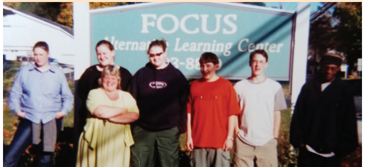
but the FOCUS has always been on the kids!