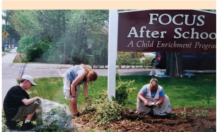
Over the past 20 years, the name has changed