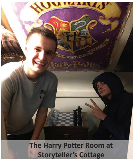
The Harry Potter Room at Storyteller’s Cottage