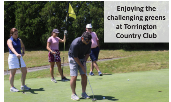
Enjoying the challenging greens at Torrington Country Club