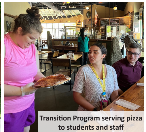
Transition Program serving pizza to students and staff