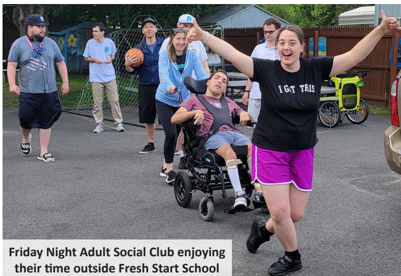
Friday Night Adult Social Club enjoying their time outside Fresh Start School

If you are interested in booking the FOCUS Autism Spectrum Unplugged panel at your school, business, or organization, call 860-693-6127 for more information.