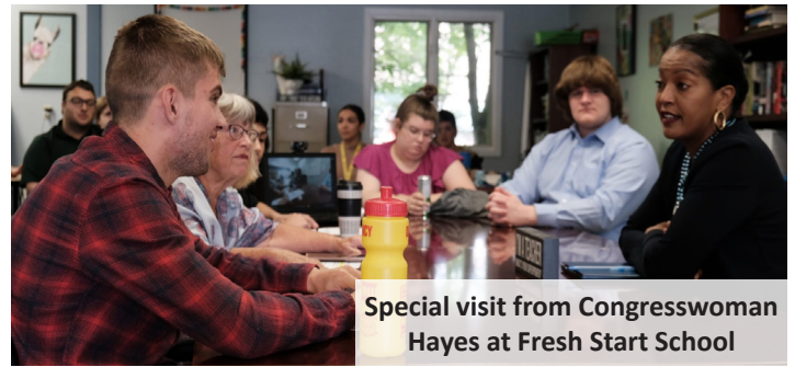
Special visit from Congresswoman Hayes at Fresh Start School