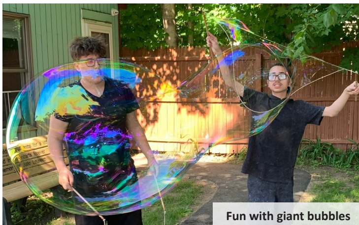
Fun with giant bubbles