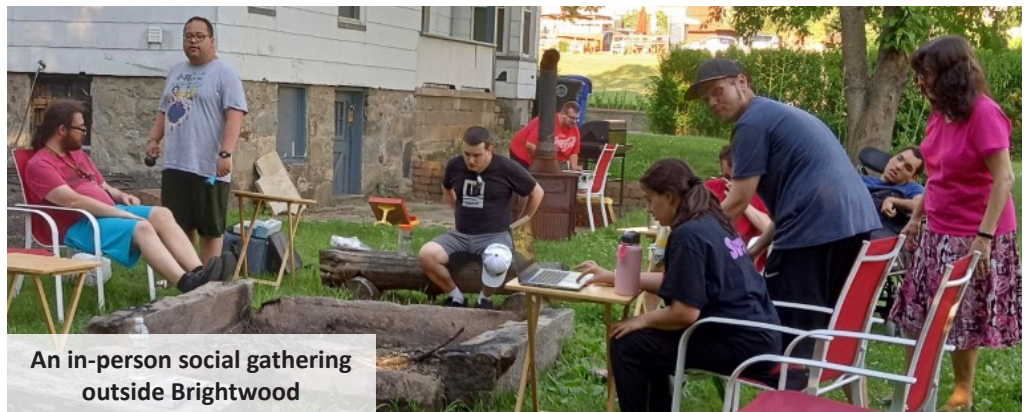
An in-person social gathering outside Brightwood

The second-floor apartment has become the solution to our space problem at Washington House. With very little meeting space available, we are utilizing the second floor at Brightwood for groups, activities, and meetings. The pandemic isolation affected our residents in terms of their autism and their mental health. Staff too were feeling the effects of virtual meetings and the loss of a sense of team. This new space allows us to use the space for social clubs and groups including cooking and healthy eating, arts and crafts, movie night, and a regularly scheduled walking group. Outside we also have space for barbecues and gardening.