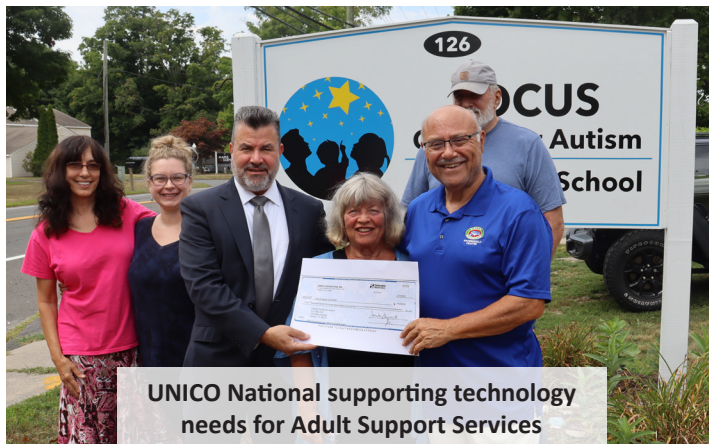
UNICO National supporting technology needs for Adult Support Services

FOCUS is grateful to have received grants recently that will fund new technology, supplies, and support for our Fresh Start School and Adult Support Service programs. Thanks to Union Savings Bank, UNICO National, and Town Fair Tire Foundation for believing in our mission and helping us to better serve the Connecticut autism community!