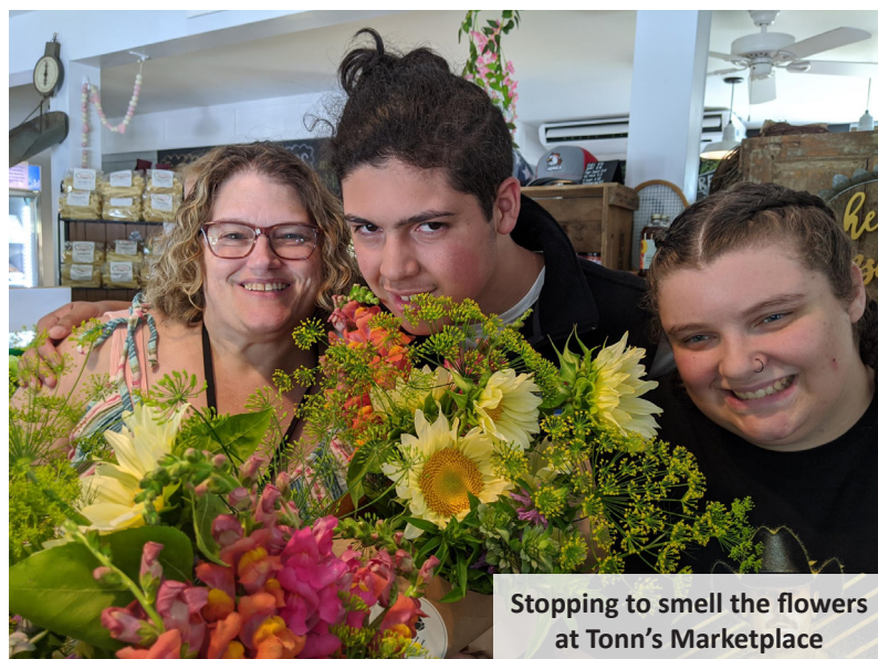
Stopping to smell the flowers at Tonn’s Marketplace