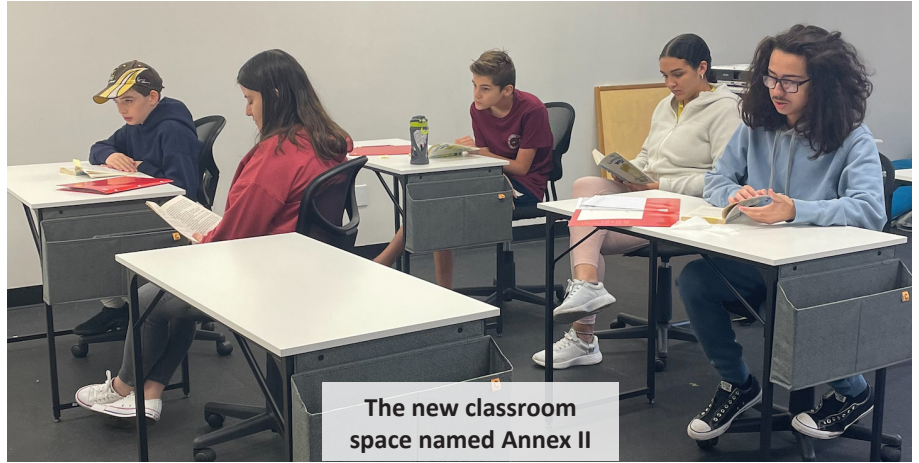
The new classroom space named Annex II

The Fresh Start School is a special program, a true gem. Our kids are those who have struggled in their traditional school settings and who need that extra clinical support in order to begin their journey of learning. At Fresh Start clinicians are available to students every day, in the program. This level of support really makes a difference, and can be seen in the evolving growth and maturity of our students.