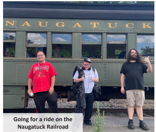
Going for a ride on the Naugatuck Railroad