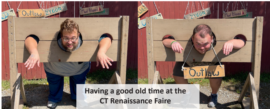
Having a good old time at the CT Renaissance Faire

To address vocational skills, we are growing our one-to-one mentoring to help prepare our folks for volunteer and paid positions in the community. We've been working on our social skills throughout the pandemic, and now we're ready to move into the community!