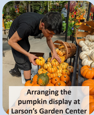
Arranging the pumpkin display at Larson's Garden Center