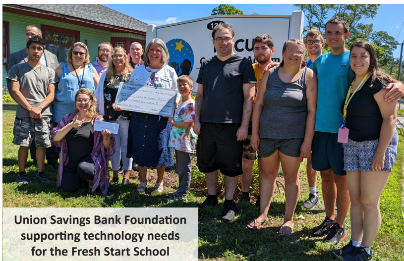
Union Savings Bank Foundation supporting technology needs for the Fresh Start School