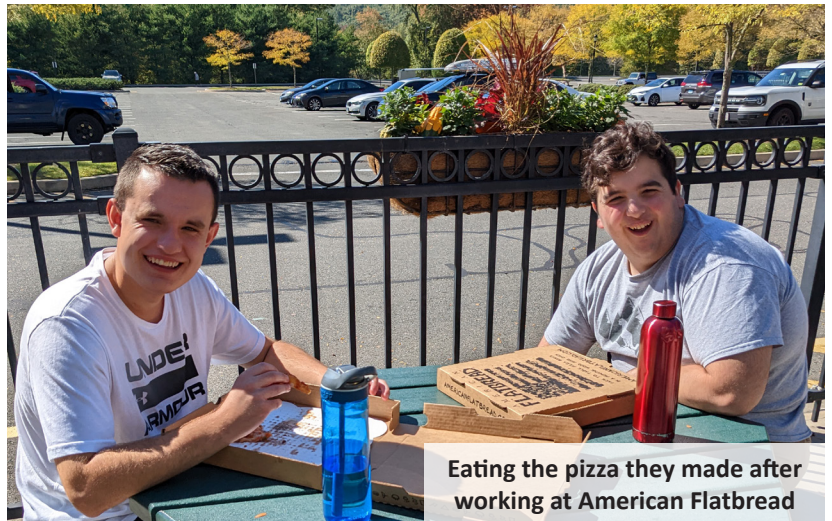
Eating the pizza they made after working at American Flatbread

These three spaces comprise the community of the Fresh Start School. The importance of community cannot be underestimated when working with students with autism. At Fresh Start our kids learn to make friends and everyone is accepted as a member of the FOCUS community. Social learning becomes a part of their daily educational experience.