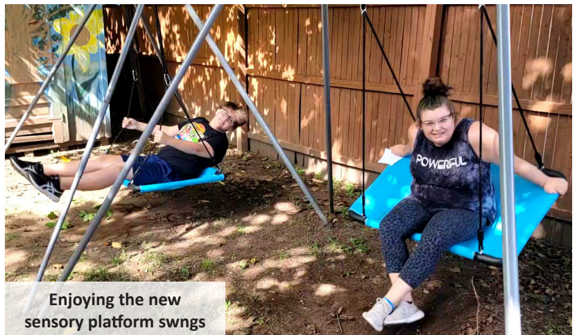
Enjoying the new sensory platform swings