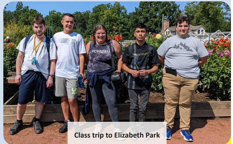
Class trip to Elizabeth Park